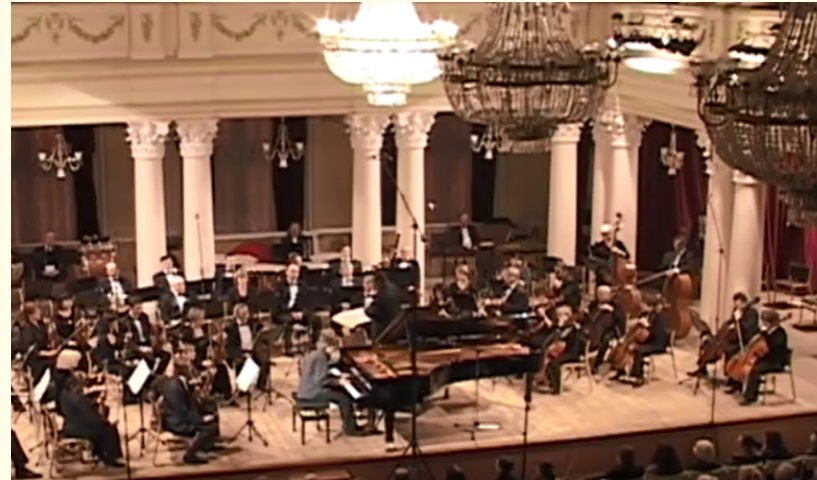
FINAL Performed by the orchestra and the soloist