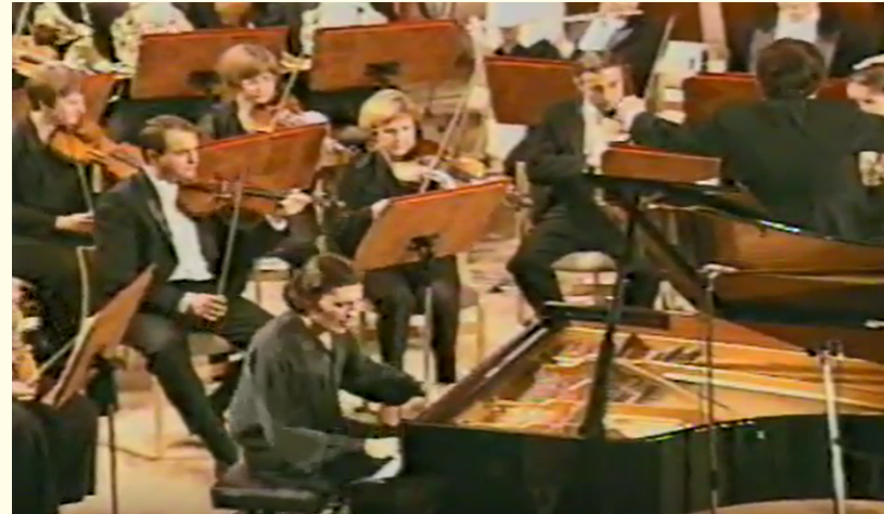
The orchestra and the soloist improvise together